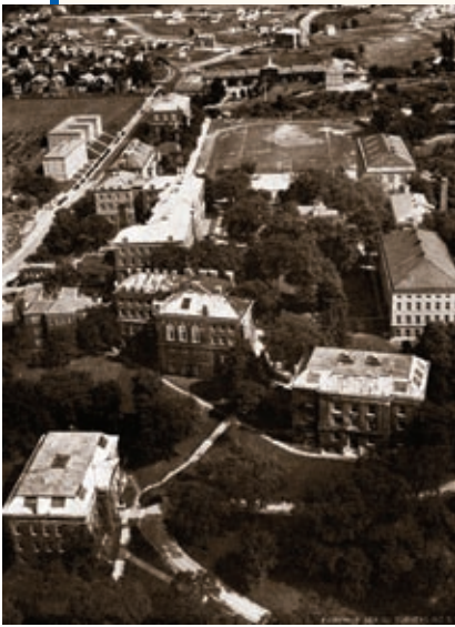
Aerial view of RPI campus circa 1933. Notice the chapter house in the background.