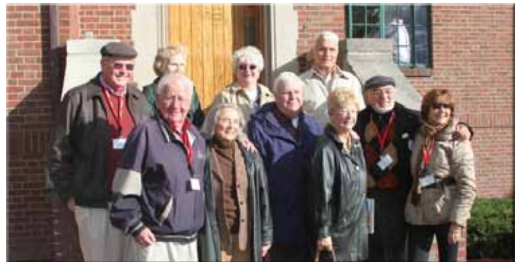
Alumni and spouses at the Homecoming/Reunion House BBQ in October.