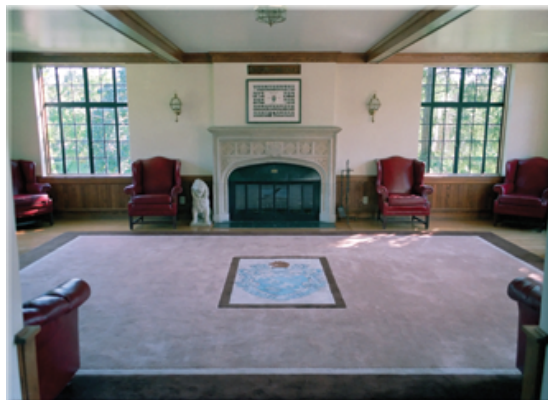
Photo of the Theta Xi Crest rug on the first floor of the House taken just after work week in late August 1989.